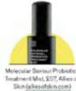
Molecular Serum Probiotic Treatment Mist, £97, Allies of Skin ( alliesofskin.com )