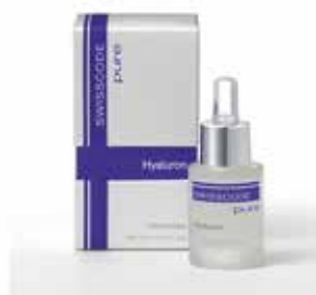
Swisscode Pure Hyaluron

According to the brand, Jen is among a handful of celebs to have credited Swisscode Pure Hyaluron as the product behind her enviable glow. Formulated with the highest possible concentration of clinical-grade hyaluronic acid , it's said to increase skin moisture levels by 20% in under two hours while enhancing the skin's absorption of Vitamin C by three times.