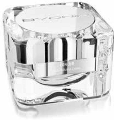
Byonik CONCUR Anti-Pollution Cream £79.00

A multifaceted moisturiser for a beautiful complexion day and night. High-quality detox agents are combined in a unique moisturising formula to protect your skin and stimulate the production of collagen, while hyaluronic acid helps to replenish the moisture reserves. Special proteins help to restore an even complexion and nourishing avocado oil lends your skin a smooth suppleness. Smoothens wrinkles, protects from damage and provides intensive moisture - day and night. A must-have for your beauty routine!