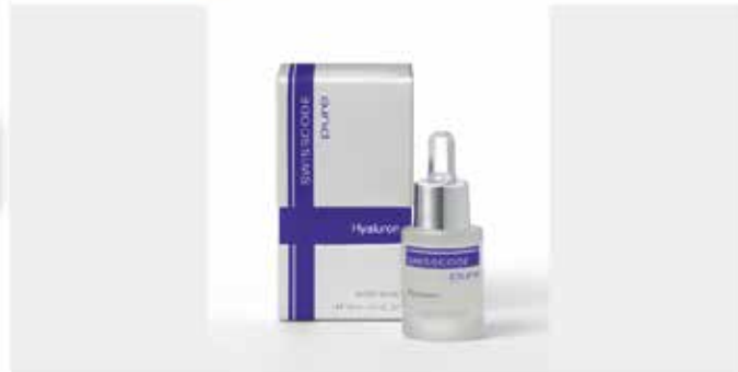
Swisscode Pure Hyaluron

According to the brand, Jen is among a handful of celebs to have credited Swisscode Pure Hyaluron as the product behind her enviable glow. Formulated with the highest possible concentration of clinical-grade hyaluronic acid, it's said to increase skin moisture levels by 20% in under two hours while enhancing the skin's absorption of Vitamin C by three times.