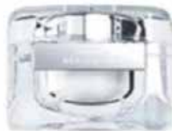
Byonik Concur Anti Pollution Cream Rich, £85, Harley Street Emporium

"Lord & Berry do a really fine loose powder. I always use it to set my make-up for my cabaret show in London. It makes your skin and make-up look flawless."