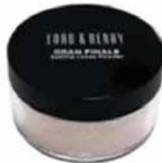
Lord & Berry Gran Finale Setting Loose Powder in Translucent, £21, FragranceDirect

"I've got to go with the classic MAC Ruby Woo lipstick, because I've worn it ever since I did Chicago [the musical]. It's the perfect red."