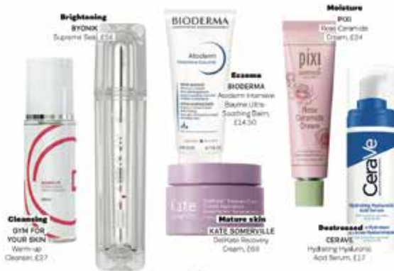
Cleansing BYONIX Supreme Toner E12

Target specific concerns with these talon-made buys