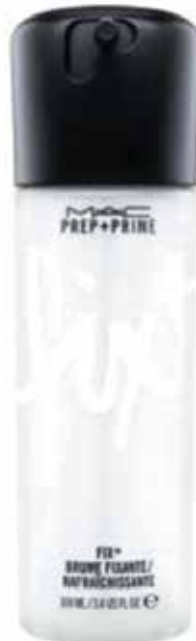
MAC Fix+ in Original, £17.60 (was £22)

"I've transformed my skin since I started having Byonik facials. This moisturising anti-pollution cream is fabulous."